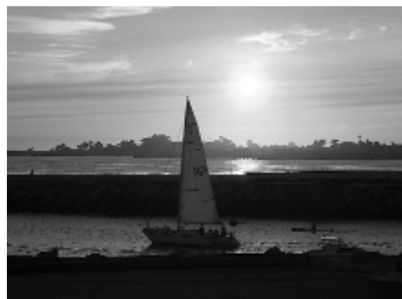
Santa Cruz beach one block from campus