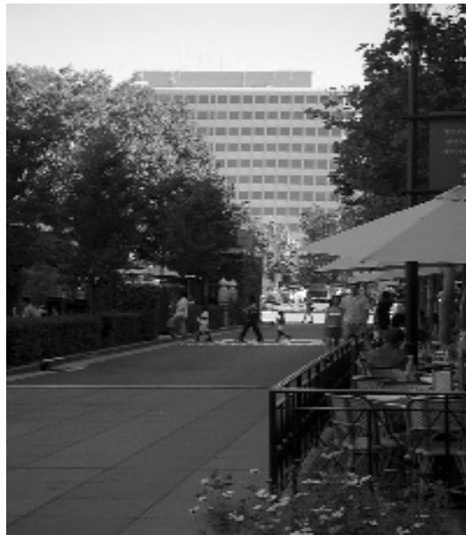
San Jose campus building seen from Santana Row

Thanks to a special city ordinance, public art is on the rise in San Jose and many pieces can be seen throughout the city in parks and downtown areas. The celebration of art and culture continues with many community events, performance companies, galleries and museums, including the renowned contemporary San Jose Museum of Art. One of the busiest venues in the world, the HP Pavilion hosts major musical acts, sporting events and conferences. The cosmopolitan Santana Row district combines shopping, dining, living and relaxing all in a beautiful tree-lined atmosphere.