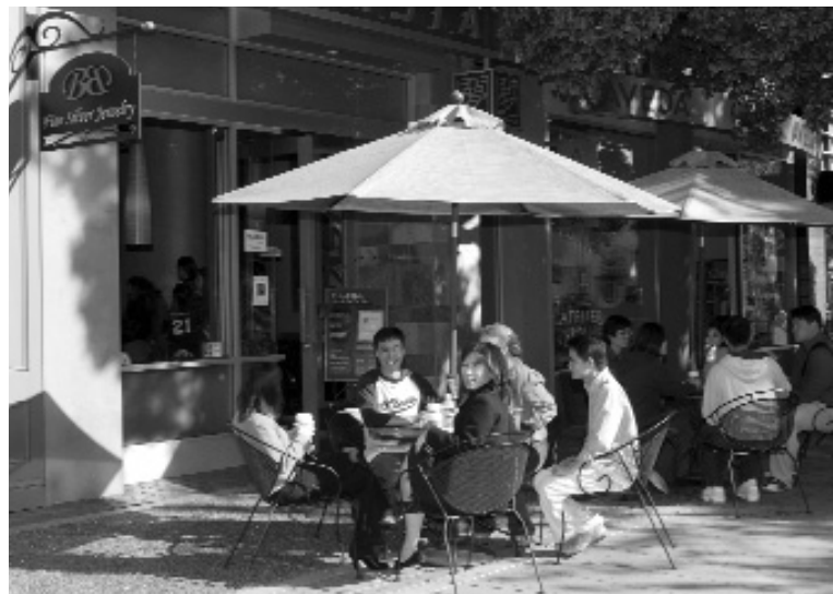
Above: Five Branches students enjoying Santana Row